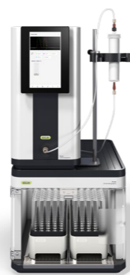
Pure Essential Chromatography System